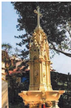
The neo-Gothic fountain outside the west door was donated by the Parsee financier Sir Cowasjee Jehangir Readymoney, who also helped fund the university buildings, 1870s. It was designed by Sir George Gilbert Scott.