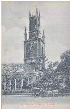
Cathedral tower, 1907