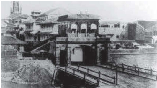
The 'original' Church Gate (one of the entry points into the Fort). The Cathedral tower clearly visible. The Western Railway station gets its name from the church in the Fort.— St. Thomas's Cathedral