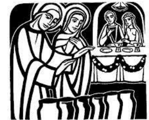
AND HE MANIFESTED HIS GLORY