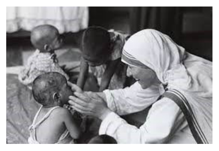
"Faith by itself, if it is not accompanied by action, is dead." James 2. 17